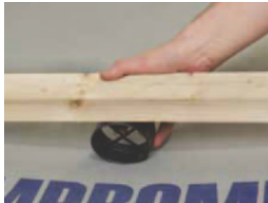
Position at regular intervals between the underlay and the rafters.