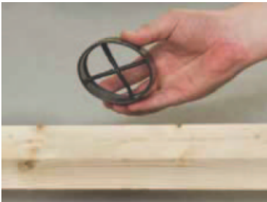
The Kima Underlay Tightener is supplied ready to use.