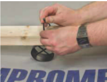
Pull the tie firmly to fix into position.